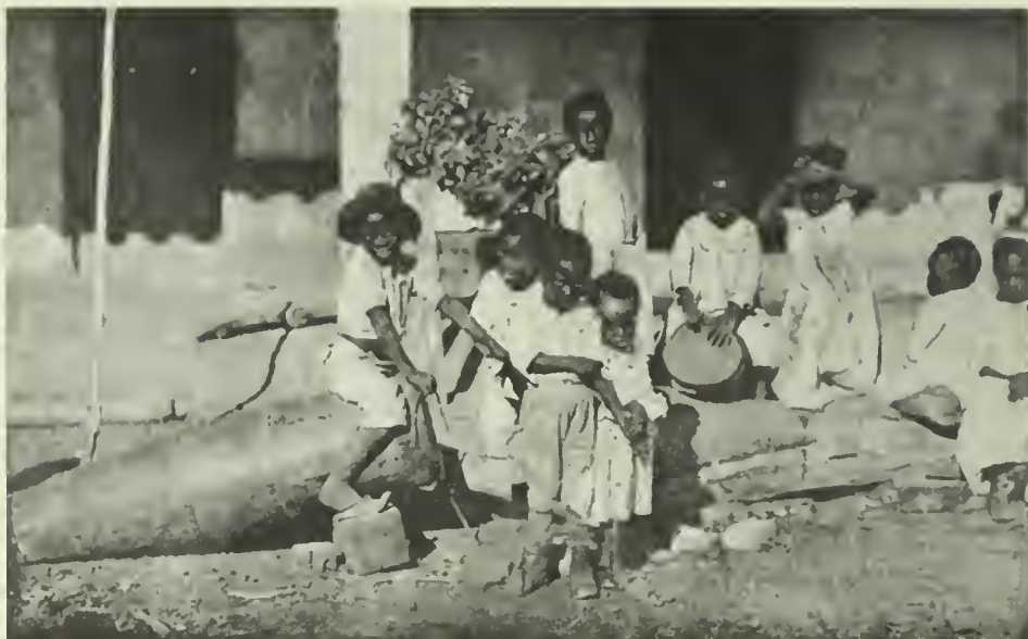
FIGURE 4.3 • Group of Negro children playing in front of schoolhouse, c. 1898. The caption noted that the children were “members of the senior class” who graduated at age eight, and that “no further schooling for negroes is provided for by the Spanish Government.” In Greater America: Heroes, Battles, Camps, Dewey Islands, Cuba, Porto Rico (New York: F. T. Neely, c. 1898).

in Cuba to “represent all residents of their respective Municipalities without distinction of races or religions”—the ayuntamiento members refused to attend the event and accused the school directors of obscuring the true intent of the activities. 62 With raised public expectations of the possibilities of politics, the limits of the ayuntamiento’s authority had changed. El Cristal gave public prominence to private struggles over education, which the Spanish government had pledged to provide to its subjects. The ayuntamiento was now but one voice in an expanded conversation about race and education, and a voice answerable to challenges to even their personal opinions.